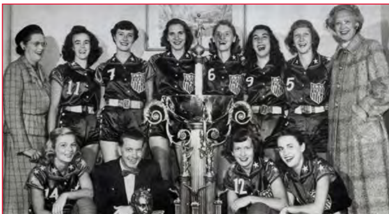
The 1953 USA World Cup Team returned home with the gold medal from the inaugural FIBA World Cup.

1986 World Championship: Held in Moscow, the United States soundly thrashed host USSR 108-88 in the gold medal game, dethroning the defending champs. Anne Donovan cited this game as a turning point for the USA in international play. It also proved the USA's Goodwill Games gold medal - also coming against the